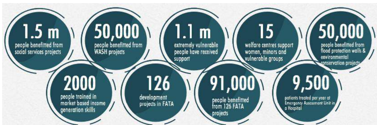
Figure: Impact of RAHA interventions